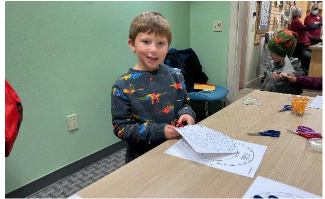
A young astronomy enthusiast makes a star wheel